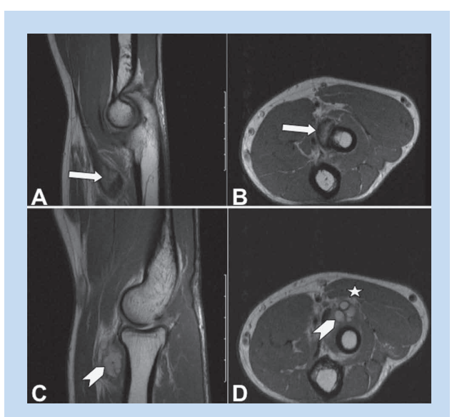
Figure 4. MRI was performed including sagittal (A, C) and axial (B, D) proton density sequences of the left elbow. A high-grade insertional partial tear of the biceps tendon at the radial tuberosity was identified (A, B – arrows). A large septate ganglion (C, D – arrowheads) was noted communicating with the bicipitoradial bursa, compressing the posterior interosseous nerve (D – star) at the supinator muscle.

rare subset of patients, Green and colleagues<sup>37</sup> found of an 8% cumulative incidence of bilateral ruptures among patients in their series of 321 consecutive patients. When compared with the 0.0012% incidence in the general population, it was deduced that prior distal biceps tendon rupture is an independent risk factor for subsequent contralateral injury.