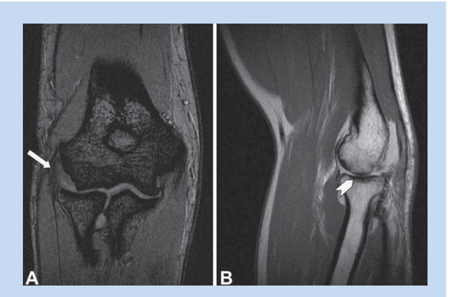
Figure 3. Coronal gradient recalled acquisition (A) and sagittal proton density (B) MR sequences, performed to "rule out lateral epicondylitis", demonstrate only mild tendinosis (A - arrow) of the extensor carpi radialis brevis without discrete tear. Full-thickness cartilage loss, however, with bone-on-bone apposition at the radiocapitellar joint (B – arrowhead) was identified as the source of the patient's symptoms.

Nonoperative management of lateral epicondylitis will result in successful resolution of symptoms in 90% of patients.<sup>18,42</sup> Conservative care may include activity modification, nonsteroidal anti-inflammatory medications, physiotherapy, corticosteroid injections, shockwave therapy, and benign neglect. Tendinitis may occur in the early stage of epicondylitis and may be responsive to anti-inflammatory measures. Later stages represent tendinosis and are less responsive to the same measures. Treatment effect on the condition's natural history, however, remains inconclusive., In chronic lateral epicondylitis, platelet-rich plasma (PRP) has been shown to effectively reduce