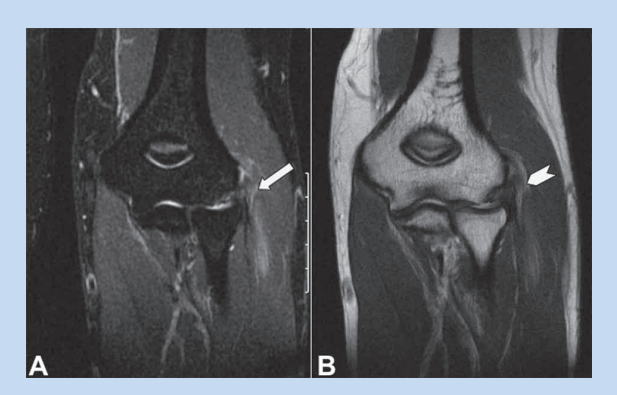
Figure 2. MRI of the left elbow demonstrates extracapsular soft tissue edema (arrow) on a coronal inversion recovery sequence (A). A high-grade proximal tear is noted in the extensor carpi radialis brevis tendon (arrowhead) on the coronal proton density sequence (B).

lateral epicondylitis, a direct correlation of MRI results and intraoperative and histologic findings has been reported.<sup>71</sup>