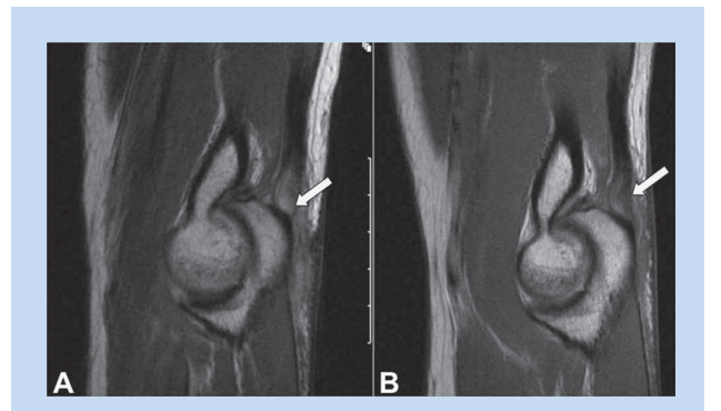
Figure 5. Sagittal proton density MRI sequence (A) demonstrates an acute partial tear of the triceps insertion (arrow) superimposed on preexisting tendinosis. One year later (B), a repeat MRI shows improved appearance of the triceps tendon but residual tendinosis (arrow).

Triceps tendinopathy and rupture constitute the least common type of elbow tendinopathy.<sup>1</sup> Triceps tendinitis and partial and complete ruptures exist on a continuum with a male predominance. Triceps ruptures have been described in patients of all ages and can be associated with total elbow arthroplasty.<sup>10</sup> These injuries also occur in younger active